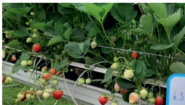
Elsanta in the trial with 50% GreenFibre® during harvest period