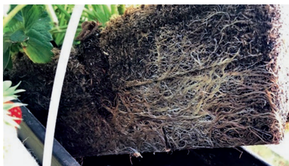
Excellent root development in the variant with 50% GreenFibre®

The variant with 50% GreenFibre® showed the highest yield for the total production of both harvest periods. The control variant, a common practise strawberry substrate, had the lowest yields.