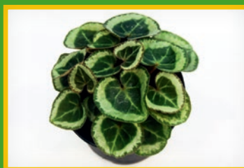
10% TerrAktiv® PLUS