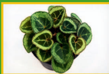
Chemically treated with fungicide