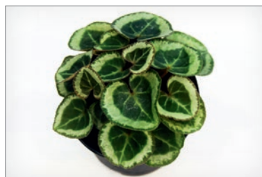
10 % TerrAktiv PLUS