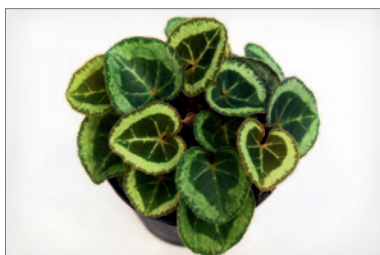
Chemically treated with fungicide